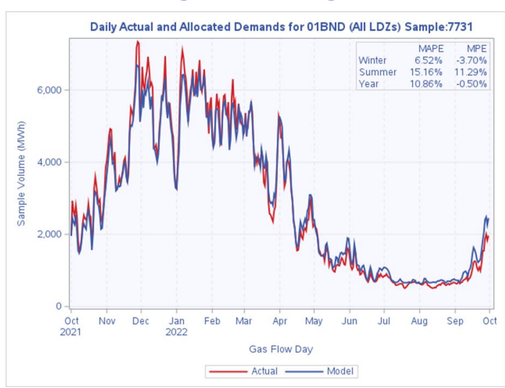
A positive MPE indicates an over forecast A negative MPE indicates an under forecast